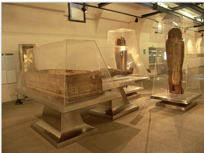
A view of the current exhibition gallery: mummy of Paefjtjauuyaset with his coffins

material coming during the 1930s from the excavations carried out by Achille Vogliano at Tebtynis and Medīnet Mâdi. Artefacts from Tebtynis were mainly daily life objects, while those coming from the temenos of Renenutet-Thermuthis at Medīnet Mâdi (ranging from the Middle Kingdom to the Graeco-Roman occupation of the site) added votive and architectural material to the collection. Particularly noteworthy is one of the two statues of Amenemhat III recovered by Vogliano in the Middle Kingdom temple.