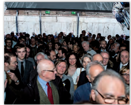
Crush of people at the opening of the Museo Egizio di Torino.

We further invite colleagues to contribute in the next issues of the CIPEG e-News and look forward to receiving your articles on museums,