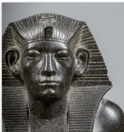
Moscow - Statue of Amenemhat III © State Pushkin Museum of Fine Arts

In May 2016 the two Amenemhats were moved to the temporary exhibition at the Hermitage Museum, but since September 2016 they have been separated again. ■