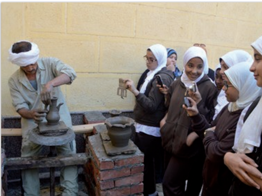
Participants making pottery.