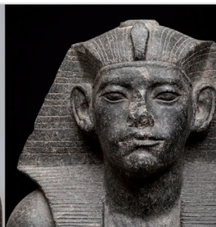
Hermitage - Statue of Amenemhat III