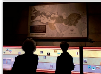
The Oriental Institute Museum, Chicago (top), Milwaukee exhibition (below).