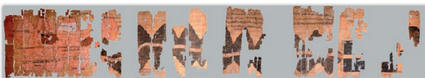
Cat. 1899+1969+1879: Turin Papyrus Map, reassembled according to a new analysis of the fibres.

> Soprintendenza Archeologia del Piemonte