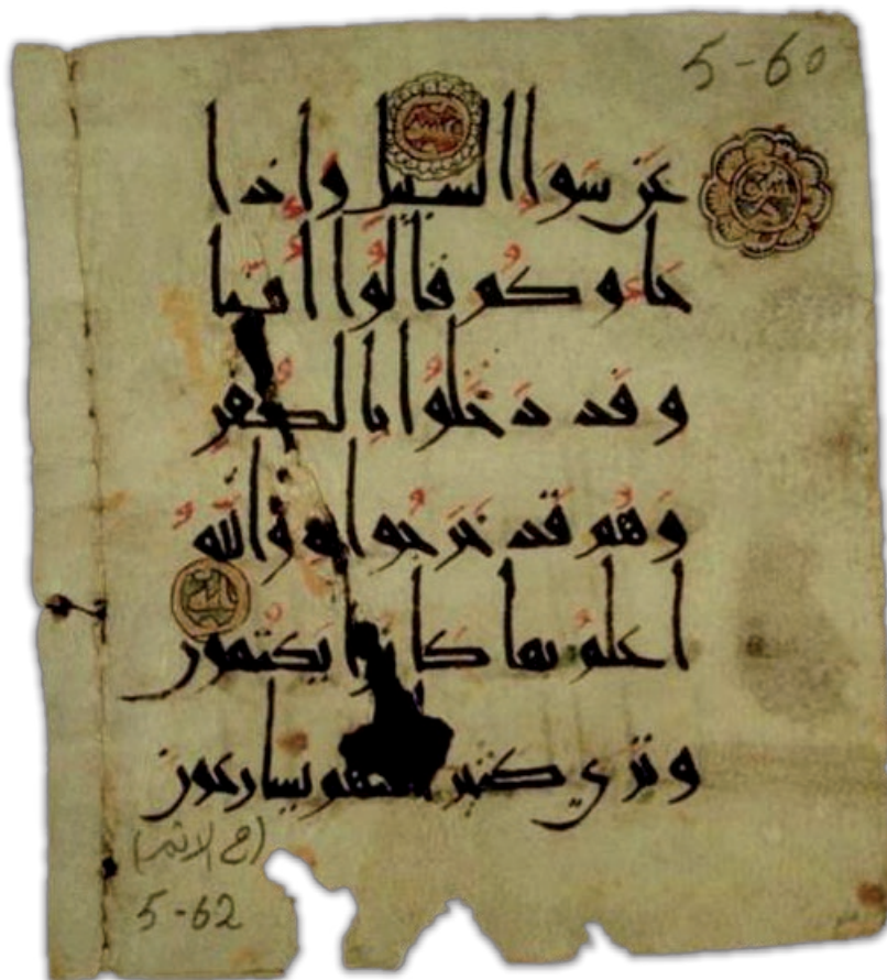
UNESCO Memory of the World Programme, Digitization project: Manuscripts of Sana'a, Grand Mosque, Yemen; Koranic fragment, 7th c.

In 2013 a MoW Sub-Committee on Education and Research (SCEaR) was created to help UNESCO institutionalize education and research into Memory of the World, its registers and the world documentary heritage. The Sub-Committee holds a Network of Cooperating Institutions and Corresponding Members (so far 46), visible on the MoW part of the UNESCO website. These come from different disciplines and represent different forms of memory institutions and engagement in documentary heritage. One aim is to build bridges between