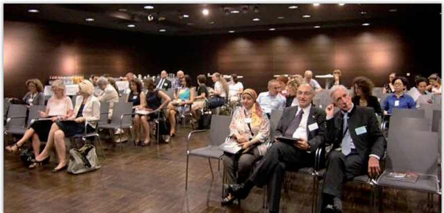
CIPEG Munich 2015.

I benefited a lot from several useful papers especially those involving new ideas for solving some of the current problems in some museums in Egypt. In the Saint Louis Art Museum (SLAM) they have employed a series of digital tools in the Egyptian gallery including the so-called Griot system that provides the public with a source for digital story telling with multimedia content (images and audiovisuals). I appreciated