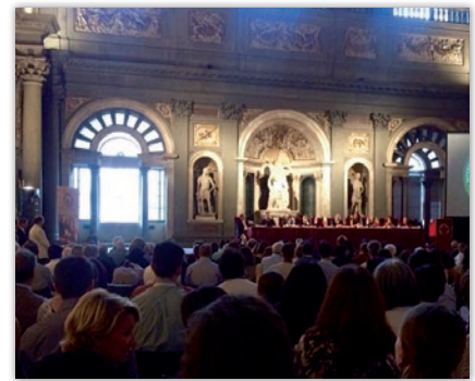
Palazzo Vecchio opening.

congress session for members of ICOM and anybody interested in museum work. It provided the opportunity to exchange short updates about Egyptological collections and to inform colleagues about the work of CIPEG. ■