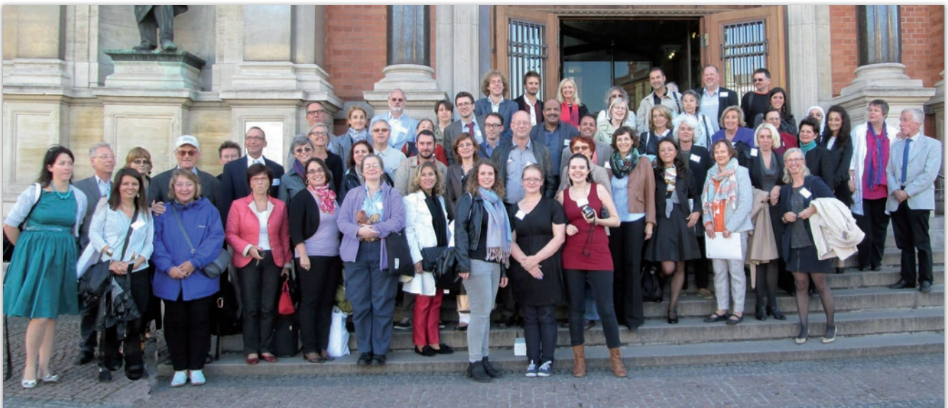
Group photo in front of the Glyptotek