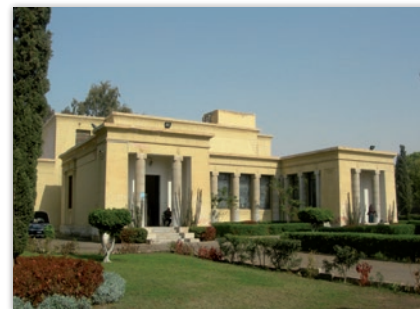
M.i.N catalogue (Cairo/Berlin, 2014).

Most recently M.i.N. has embarked on a project to study and publish the antiquities in the Ismailia Museum . Founded in 1930 as one of the best archaeological museums in all of Egypt, it still lacks a published catalogue. The building, designed in Egyptianizing style, stands within a well-kept garden which exhibits larger antiquities. “The Ismailia Museum” , is planned to be the third catalogue of the M.i.N. series. ■