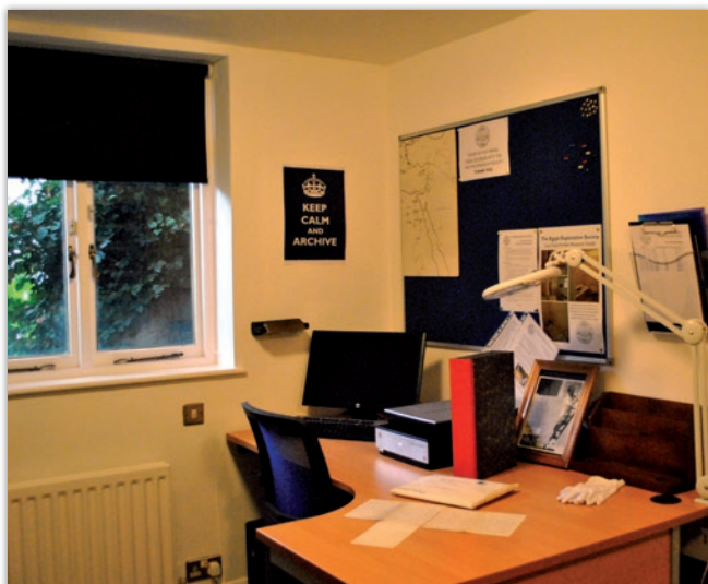
New archive storage in The Egypt Exploration Society.